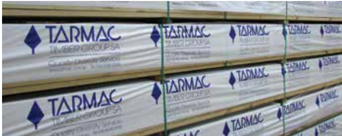
F7 DRESSED ALL ROUND