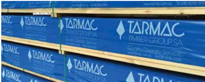
F7 ROUGHER HEADER