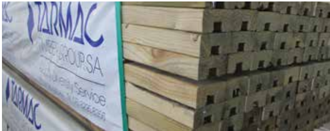
CAPPING and CUSTOM PROFILES

ACQ Clear Pine 90 x 22 Premium Decking is also available