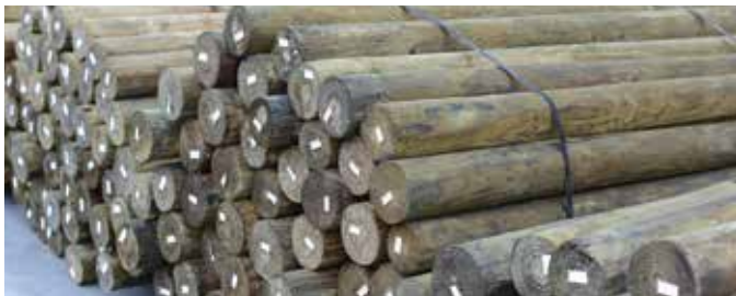
SHAVEN / CAMBIO POSTS