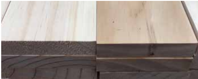
PINE 19mm BOARDS

Standard Lengths 2.1 / 2.4 / 2.7 / 4.8 metres